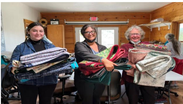
Staff from Mountain Crisis Center loaded up with the large quilts made and donated by the Bits and Pieces quilting circle