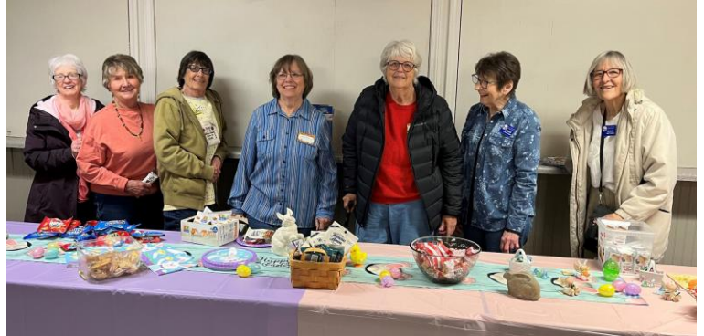
Sew Thrilled hostesses for the meeting set a lovely table complete with Easter bunnies and lots of colorful eggs.