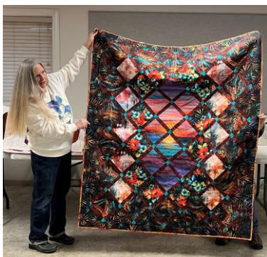
Laura's daughter's wedding quilt.