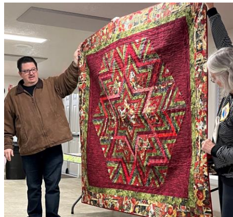
This is definitely "NOT Your Grandmother's Log Cabin!"