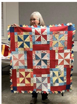
Kathy's Circle of Nine Quilt