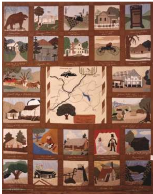
SMQA Historical Quilt hanging in Fresno Flats Museum.