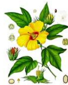
Botanical illustration by Franz Eugen Köhler, 1897

Production of Supima cotton has risen from about 100,000 bales per year in the 1980s to over 800,000 bales in 2006. More than 90% of Supima cotton is exported from the United States, the majority of this being for the overseas manufacture of yarn, finished fabrics, clothing, sheets and towels which are re-exported to the United States for sale. The top five importers of Supima cotton are China, India, Pakistan, Turkey, and Peru.