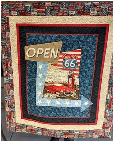
One of Lissa Metzger's Car Quilts