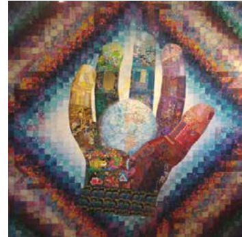
Imagine Peace on Our Planet

Welcome to my world, where I firmly believe you can do whatever you set out to do, as long as you have the tools and techniques to get you there. If you visit my website at www.ShortAttentionSpanQuilting.com you will be able to see some of my quilts and garments, get an idea of the workshops and classes I teach and the trunk show/talks I give, get a flavor of who I am, read an essay, or find some new things to play with. After wandering around a bit and seeing my work, you might like to have me come do a trunk show and/or a workshop for your guild, commission a quilt or you might just want to take one of my online classes at www.AcademyofQuilting.com . So, here's the basic information, and if you do wish me to come and visit, my calendar is on the Welcome page of my website.