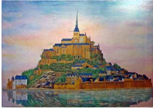
Mt. St. Michel Memories

e-mail address: shortattn@comcast.net online classes - www.AcademyofQuilting.com