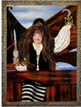
The Dread Pirate Lizzy