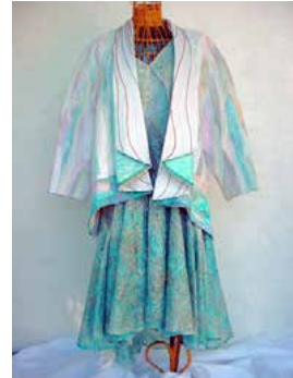
Where the River Meets the Sea