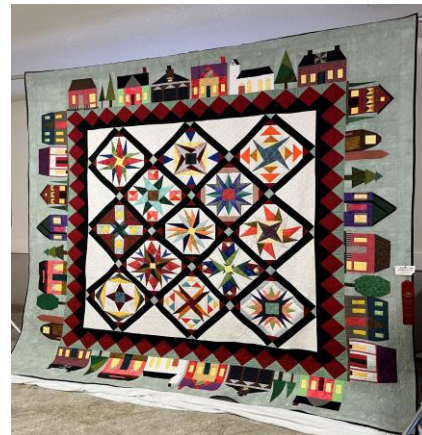
Mother Lode Quilt Guild's Opportunity Quilt.