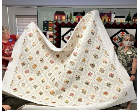
Wendy's embroidered flowers quilt.