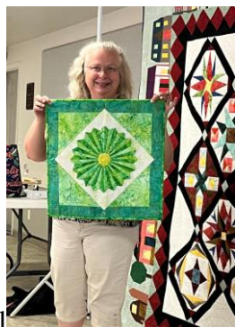
Margie's colorful Dresden plate small quilt.