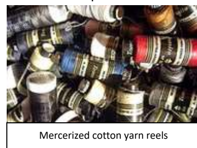
Mercedised cotton yarn reels