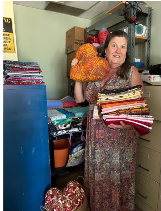
Oakhurst Healthcare very grateful for the quilts, wheelchair bags, and pillows.