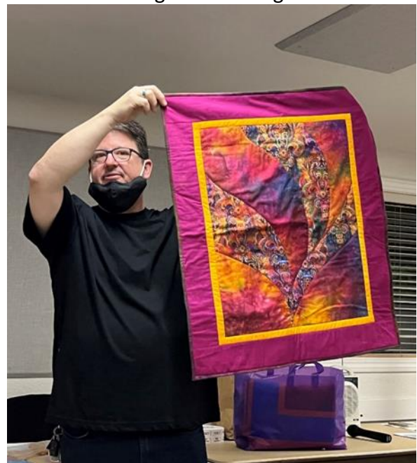
John Egbert Convergence